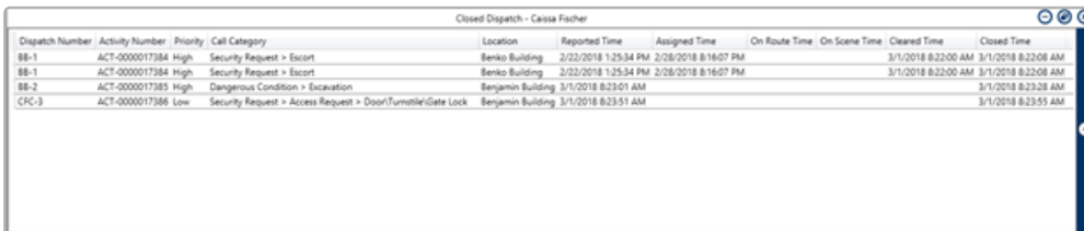
The Closed panel.