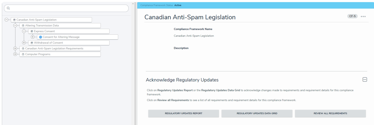
Viewing a regulatory compliance framework.