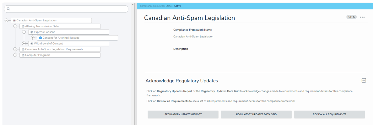
Viewing a regulatory compliance framework.