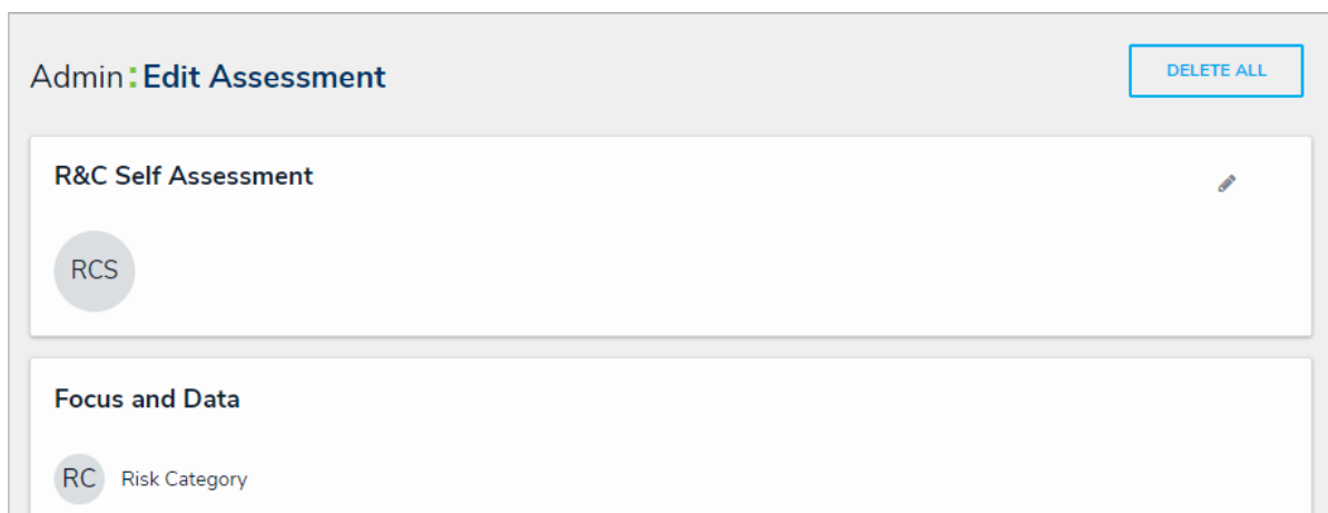
The Delete All option on the Edit Assessment page.