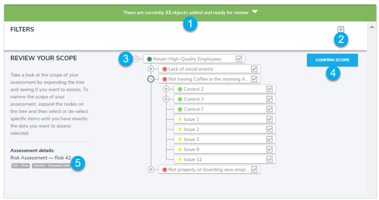
The assessment navigation form, which is accessed after adding objects and instances to the scope.