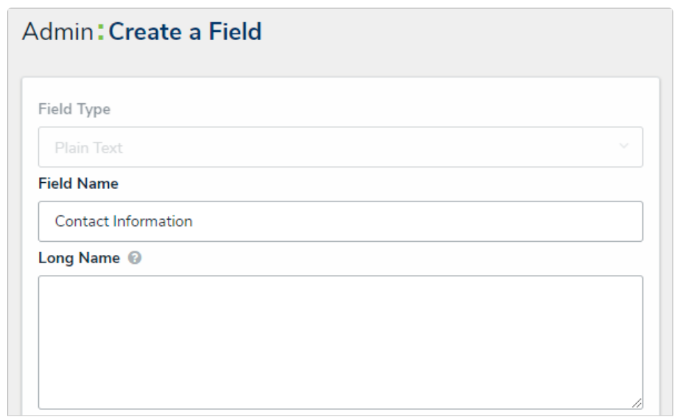
The Field Name and Long Name fields.